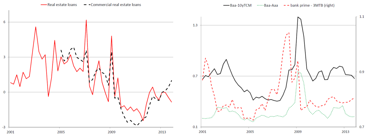
Figure 1: Financial data

Note: Both data on real estate and commercial real estate loans of all commercial banks and on spreads are extracted from the FRED database. Baa corporate bond yield relative to yield on 10-Year Treasury Constant Maturity (Baa-10yTCM) and Baa minus Aaa corporate bond yield are reported on the left axis, while the bank prime loan rate minus 3-month Treasury bill is reported on the left axis.